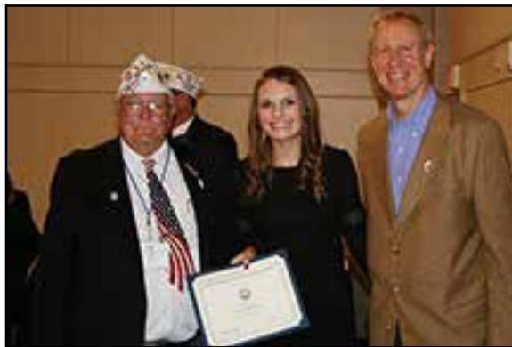
Darian Mulholland Service Foundation