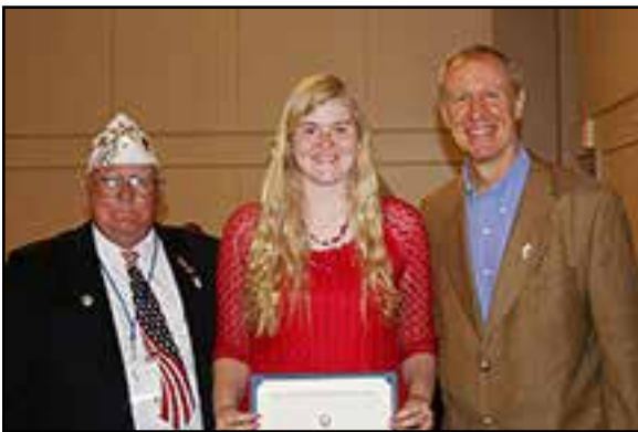
Shay Sullivan Service Foundation