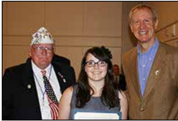
Elizabeth Bradbury Service Foundation