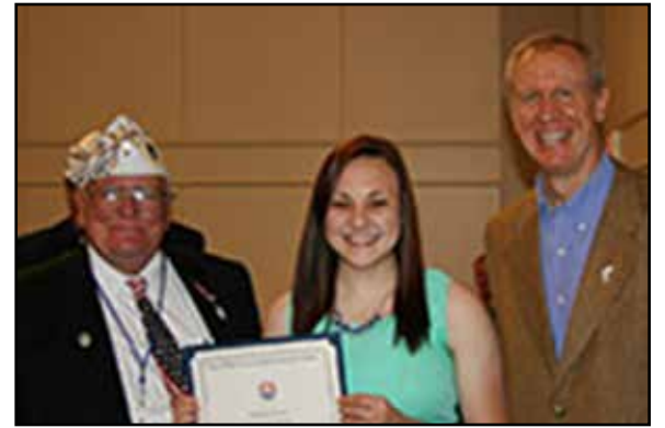
Chloe Callahan Service Foundation