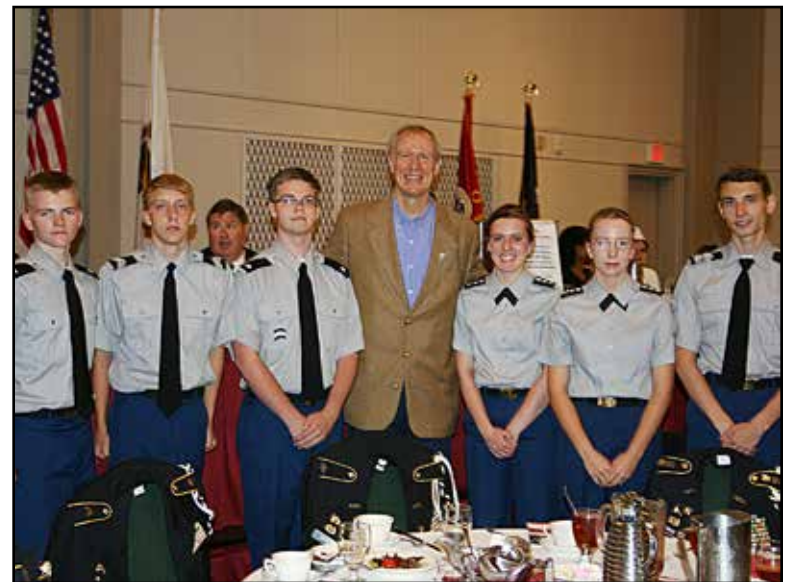
Right: Governor Rauner spoke with Pekin Community High School JROTC Color Guard.