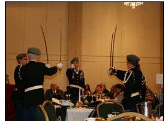
Pekin Community High School JROTC Color Guard