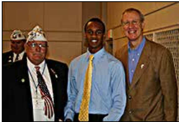
Jeremy Green Service Foundation