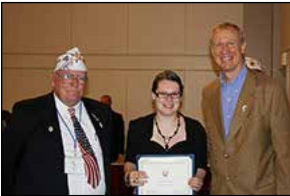
Danielle Dayton Service Foundation