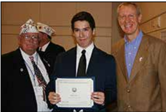
Bryan Lee Service Foundation