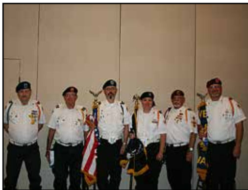
AMVETS Post 30 Ottawa Color Guard