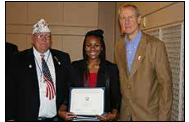
Anjae Holder Service Foundation