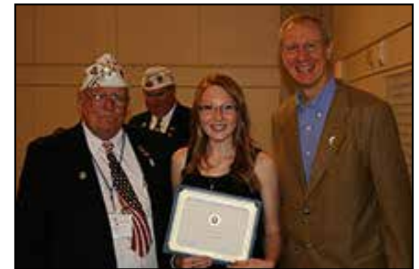
Makelle Rowe Service Foundation